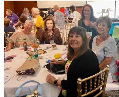
Enjoying the meeting! Some Members of the Women's Club of Madison.