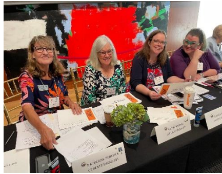
Fall Conference and some of the Executive Committee.