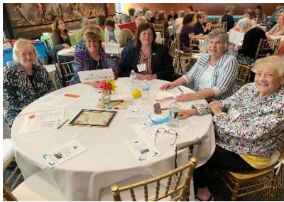
Past State Presidents Table. Always supportive and dedicated to GFWC!