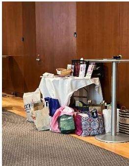
Prudence Crandall Donations for Domestic & Sexual Violence Prevention Awareness-Signature GFWC Project!

Thank you to all who donated $$$'s of items, gift cards and money!